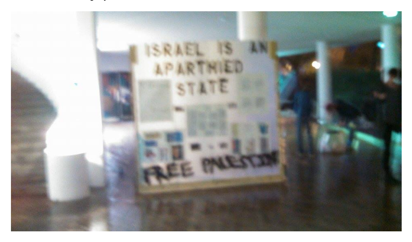
Exhibit A: The display before the first vandalism incident